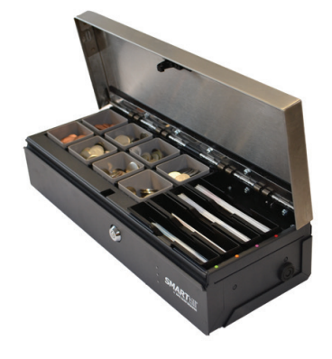
SMARTtill Model (4 Note Version)