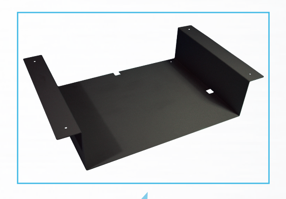
Under Counter Mounting Bracket